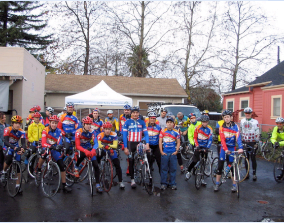
Before leaving the bike shop we all posed for a group shot.